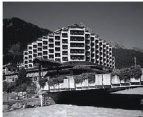
Alpina Chamonix Hotel

Chamonix offers skiing and snowboarding for all levels. It has tremendously long slopes, glade skiing, free ride and off-piste slopes. Chamonix, 1924 Winter Olympic Games site, is a popular tourist destination that links Italy via the Mont-Blanc tunnel.